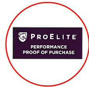
PROOF OF PURCHASE SEAL EXAMPLE TO SUBMIT