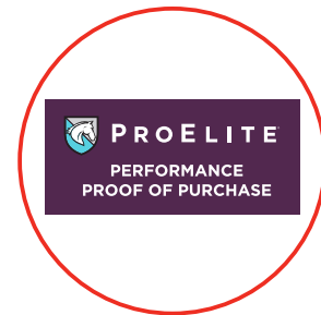
PROOF OF PURCHASE SEAL EXAMPLE TO SUBMIT